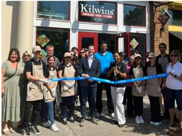
On June 22nd, IN WDSTK held a ribbon cutting to celebrate the 1 year anniversary of Kilwins opening in Downtown Woodstock