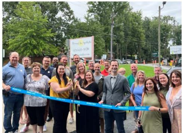
IN WDSTK held a ribbon cutting on August 10th to celebrate the opening of Beyond The Spotlight Dance Studio in Downtown Woodstock!