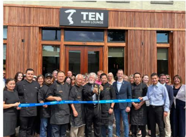
On July 12th, IN WDSTK held a ribbon cutting to celebrate the opening of TEN Sushi Lounge in Downtown Woodstock!