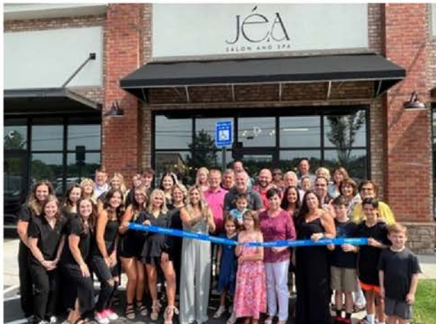
IN WDSTK held a ribbon cutting for Jéa Salon and Spa on July 22nd to welcome them to Woodstock and celebrate their grand opening.